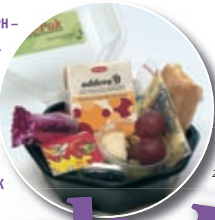
Snak-pak 2500 kilojoules 20 grams of protein

1 Department of Hepato - Gastroenterology V Aarhus University Hospital 2 Institute of Public Health Department of Nursing Science University of Aarhus DENMARK